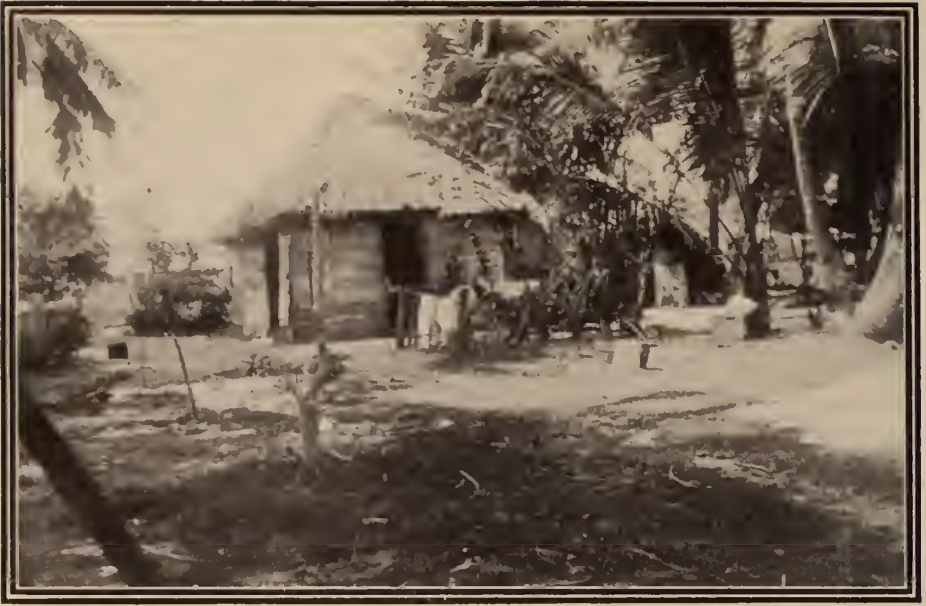
A COUNTRY HOME UNDER THE PALMS IN PORTO RICO